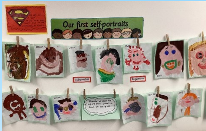
Examples of Year 4 and Reception 'Self-Portraits' on display in school