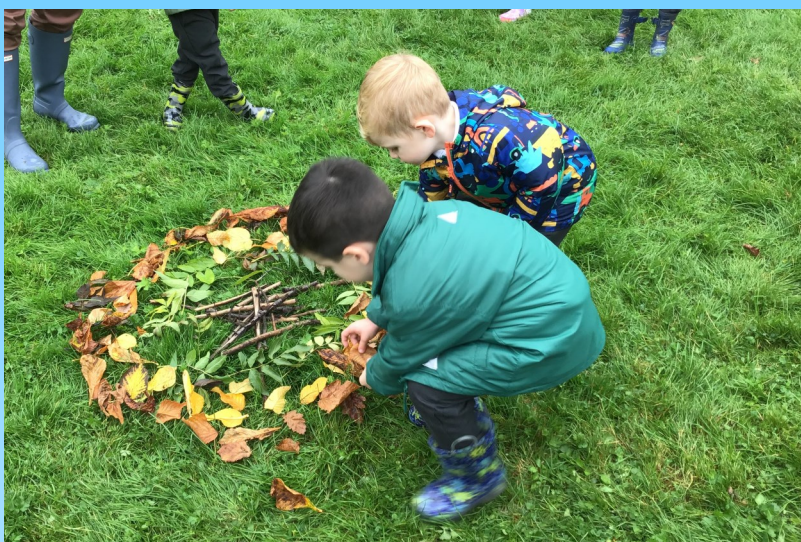
Children enjoying the signs of Autumn in our school grounds.