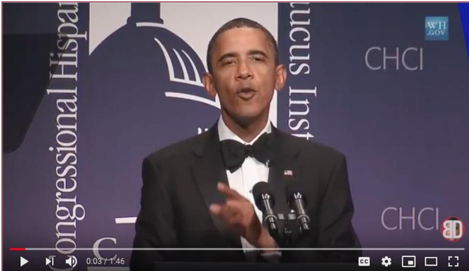
Barack Obama Singing Call Me Maybe by Carly Rae Jepsen