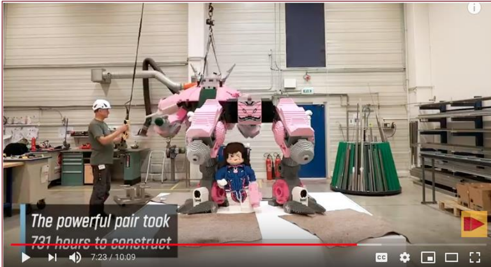
Timelapse: 10 Epic LEGO Models Built Before Your Eyes!