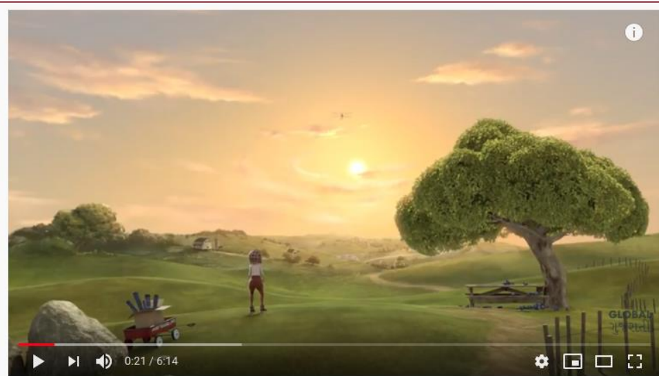
Motivational Film | Award Winning Animated Short Film | Alyce Tzue