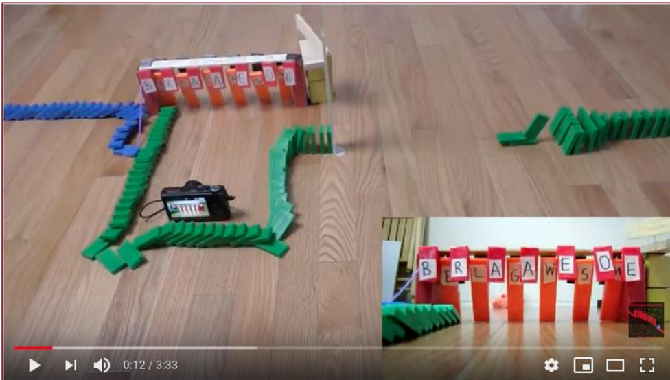
31 UNREAL Domino Tricks! (10,000 Dominoes)